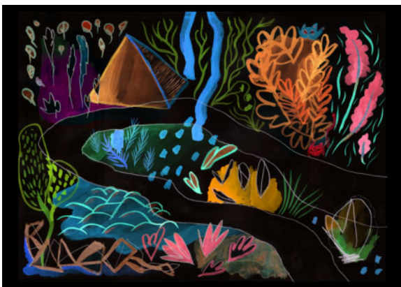
“Now/Here” (2014) Iteke Hemkes

Series of illustrations for a children's book about getting lost, which means you will discover more when you are not knowing.