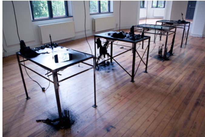
“The Full Solution, part 1” (2014)

An attempt in wax to solve all the questions under our sky and question our clinging on to 'form'.